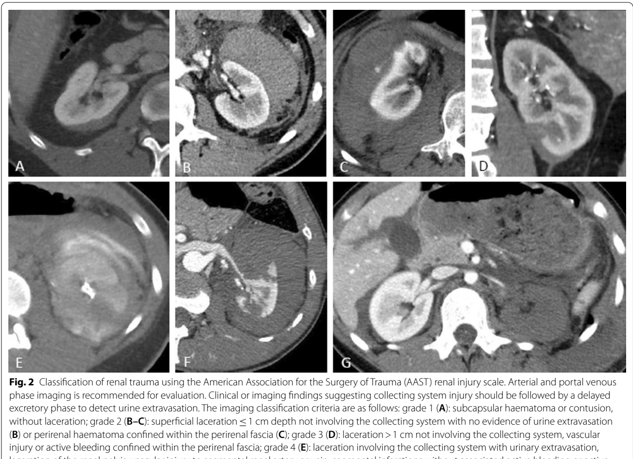
injury or active bleeding confined within the perirenal fascia; grade 4 ( E ): laceration involving the collecting system with urinary extravasation, laceration of the renal pelvis, vascular injury to segmental renal artery or vein, segmental infarctions without associated active bleeding or active bleeding extending beyond the perirenal fascia, grade 5 ( F–G ): shattered kidney ( F ), avulsion of renal hilum or laceration of the main renal artery or vein or devascularized kidney ( G ) [19]

1-3) and high-grade renal trauma (grade 4 and 5). All patients were observed during hospitalization, including bed rest, fluids, prophylactic antibiotics, analgetics and regular laboratory controls and monitoring. We performed a CT scan after 48 h in all inpatients based on our institutional practice. Additionally, a CT was always indicated when acute clinical symptoms (haematuria, fever, flank pain, haemodynamic instability) occurred to assess for acute complications and the need for subsequent intervention. With reference to the current standard of management of renal trauma, a non-surgical observational therapy approach was primarily chosen whenever possible. Acute intervention was performed in patients with haemodynamic instability, grade 5 vascular injury and life-threatening circumstances. Furthermore, within these subgroups we correlated rate and extent of intervention comparing the decision on either the base of the 48 h repeat CT versus onset of clinical symptoms. Minimally invasive therapy included angiography with selective