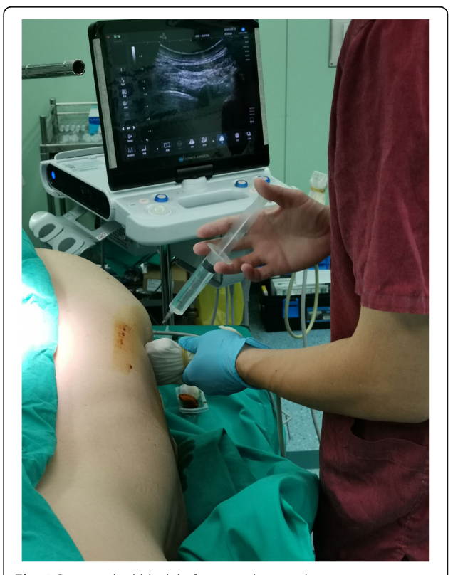
Fig. 2 Paravertebral block before anesthesia induction

anesthesia induction (Fig. 2). The anesthesia level was ensured to cover the entire operation area. Patients were placed in the lateral position (lateral fractures), supine position (anterior and anterolateral fractures), or posterior decubitus position (posterior fractures). Electrocardiography, noninvasive blood pressure, pulse oximetry, and index of consciousness (IOC) measurements were