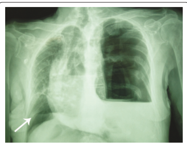
Figure 1 Initial chest x-ray showing a left tension pneumothorax with shift of the mediastinum to the right, pleural effusion left, basal dorsolateral rib fractures. There's also air visible under the right diaphragm (arrow).

this procedure the herniated and perforated part of the colon was removed, a transdiaphragmatic lavage was undertaken and the omentum was used to close the diaphragmatic defect (Figures 3 and 4). A mesh or sutures were not used since the abdomen was contaminated with feces. The 92-year-old-patient deceased on the fourth post-operative day due to respiratory insufficiency. Both the patient and family were in consent for abstinence from further invasive therapy.