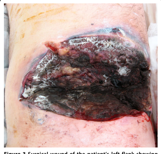
Figure 3 Surgical wound of the patient's left flank showing necrotizing soft tissue infection covered by white patches of fungi.

H1N1 influenza in pregnancy has been discussed in the literature before [12-15]. The patient described in the second case report had a remarkable past history for having a total gastro-esophagectomy and colonic interposition due to caustic injury 8 years ago. She had one vaginal delivery 6 years ago, and had a relatively normal