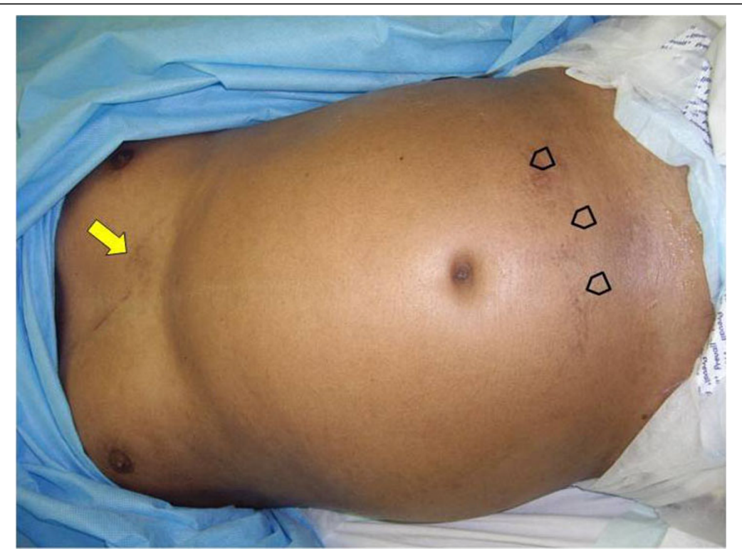
Figure 1 Seat belt sign crossing obliquely through the chest (arrow) and transversely through the lower abdomen (arrow heads).