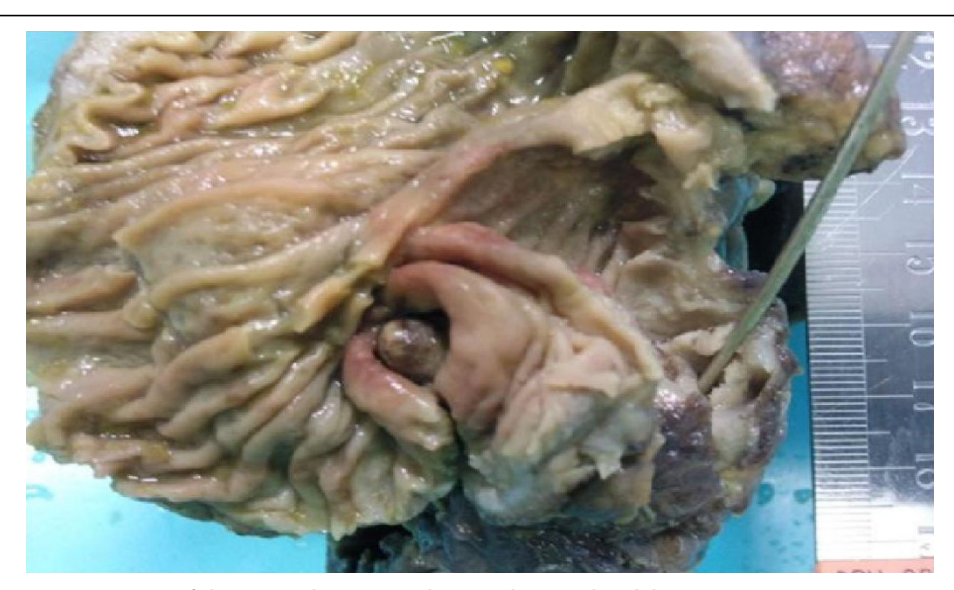
Figure 1 macroscopic appearance of the resected specimen showing the caecal nodule.

The aetiology of endometriosis remains unknown and controversial [2,7]. There are many theories but currently the most widely accepted theory is that of 'retrograde menstruation' causing the implantation and growth of endometriosis on the serosal surface of extrauterine organs or occurring secondary to metaplasia in the pelvic peritoneum [2,5,8,9]. The concept of 'retrograde menstruation' is supported by the mainly pelvic