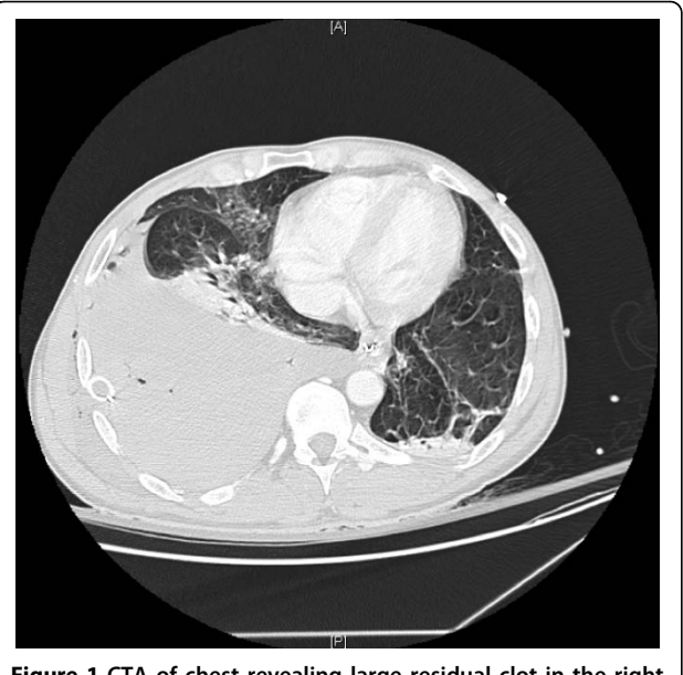
Figure 1 CTA of chest revealing large residual clot in the right hemi-thorax . This study was performed in an attempt to localize the bleeding source in our patient. The study was negative in terms of identifying an anatomic source of bleeding (most relevant with respect to examination of the great vessels in the thoracic outlet, albeit falsely negative). However, this study served as a proxy for the post-thoracostomy chest x-ray and identified the insufficient drainage of the right chest with the thorocostomy tube in place.

CT, a residual clot occupying the > 50% of the right chest was appreciated (see Figure 1). There was no evidence of intra-abdominal injury on the CT scan of the abdomen. A second thoracostomy tube was placed and approximately 2.2 L of blood were evacuated with suction. Given that this output now met criteria for surgical exploration, the decision was made to take the patient to the operating room for an exploratory thoracotomy (PAT + 60 min). Resuscitation up to this point consisted of 4 L of crystalloid and 6 units of PRBCs.