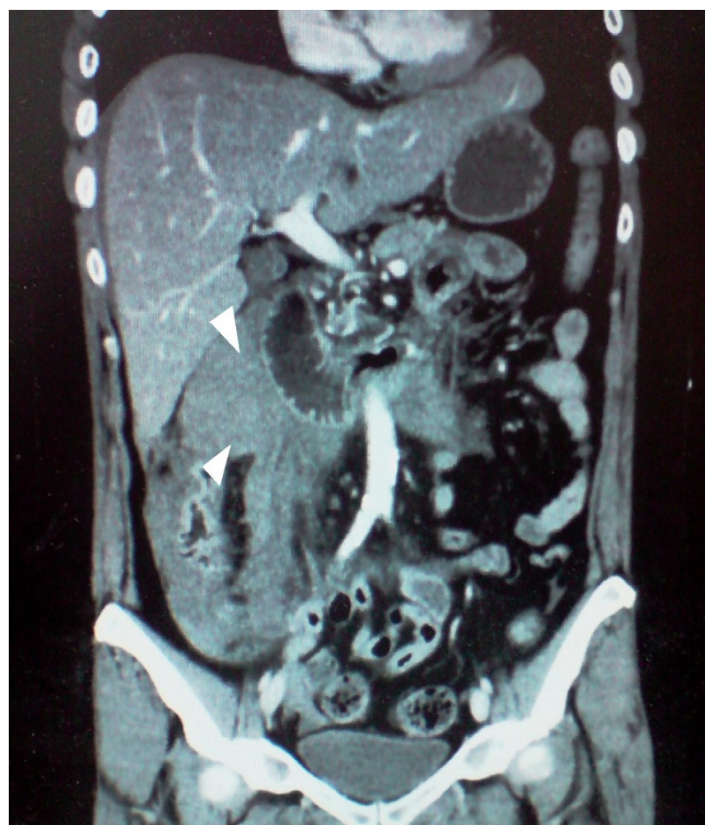
Figure 3 Paraduodenal hematoma shown in the coronal Abdominal CT with contrast. (White arrowhead).