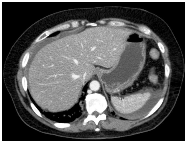
Figure 1 Abdominal computed tomography (CT) scan (axial) with intravenous contrast demonstrating an important hemoperitoneum with densities around the spleen and the right lobe of the liver.

It was impossible to obtain the opinion of either a vascular surgeon or an interventional radiologist for this acute intraabdominal hemorrhage, and it was indispensable to shift the patient to the operating room for an emergency surgery to control the source of bleeding. An emergency exploratory laparotomy was performed under general anesthesia. This Surgical exploration showed an important hemoperitoneum and a large periduodenal hematoma which was extending into the retroperitoneal space. Two liters of blood were evacuated from the free peritoneal cavity. Besides, we noted a significant bleeding from the right gastroepiploic artery, with no obvious aneurysm, that was successfully ligated. Further exploration identified no additional bleeding, and the retroperitoneal hematoma was respected. The patient recovered well without postoperative complications and she was discharged 5 days after the surgery.