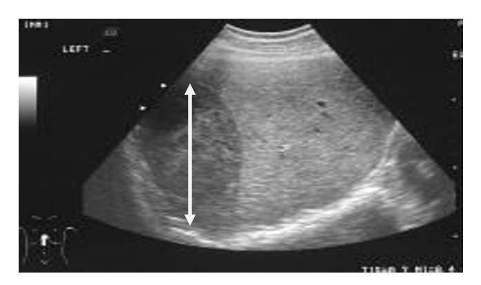
Figure I Liver ultrasound shows large haematoma (white arrow spanning the length of the hyperechoic area representing fresh blood).

She received 4 units of O negative blood. A repeat ultrasound one hour later revealed free blood in the abdominal cavity; the fetal heart beat was now absent.