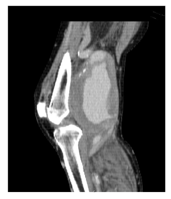
Figure 2 CT lateral projection showing the popliteal artery aneurysm with the pseudoaneurysm.

The dilemma was therefore a patient with an established pulmonary embolus and a friable clot in the iliac veins, anticoagulation and the treatment of the ruptured aneu-