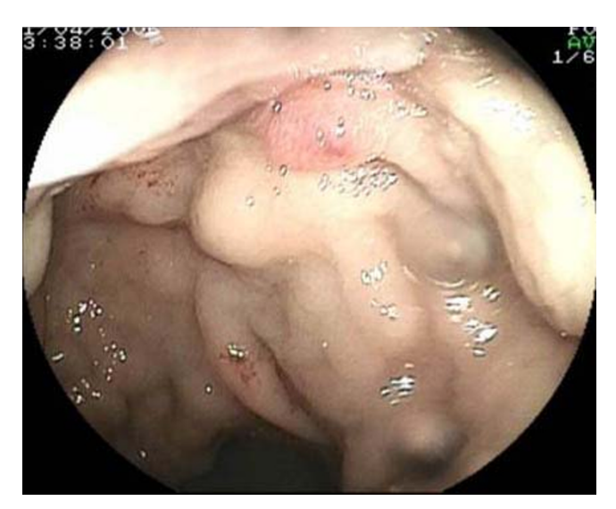
Figure I Endoscopic view of the rectum showing rectal varices, one of which demonstrates a red wheal consistent with recent bleeding.