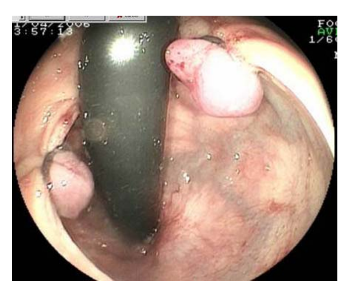
Figure 3 Retroflexed view after endoscopic placement of two bands.

while also addressing his abnormal coagulation. Failure of the bleeding to lessen however mandated an attempt at more definitive intervention. Given that this episode represented the patients first episode of decompensation on a background of Child's B liver disease, we were reluctant to proceed directly to formal mechanical portal vein decompression (by means of portosystemic shunt created either by a Transjugular Intrahepatic approach [i.e. TIPS] or open operation) and therefore considered the available endoscopic treatments proposed in the literature.