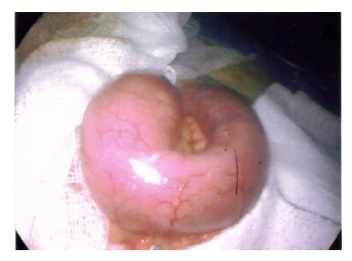
Figure 4 Dilated jejunum delivered through minilaparotomy.

Patients with impaction in small intestine present with symptoms of vomiting, abdominal distension, and constipation. There are cases of cholangitis [5] and recurrent