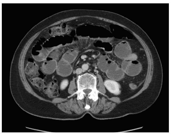
Figure 2 Emergency CT scan showing small bowel dilation with a point of abrupt change in calibre and angulation in the distal jejunal loop. The small bowel distal to this point was collapsed.

A clinical decision was made to proceed with laparoscopy. On laparoscopy, there was dilatation of the small intestine up to the distal jejunum (figure 3) with collapsed bowel beyond that point. The serosal surface of the small intestine looked normal. There were no adhesions between bowel loops; mesentery was normal with no evidence of lymphadenopathy. There was an area of sudden change in calibre with dilated proximal and collapsed distal segment in distal jejunum. The dilated segment of distal jejunum was brought out by a midline minilaparotomy of five centimetres (figure 4). A foreign body, dried undigested apricot, was extracted (figure 5). The bowel at the point of impaction was normal and closed in two layers. Laparoscopically, we were unable to identify any other abnormality in the small bowel.