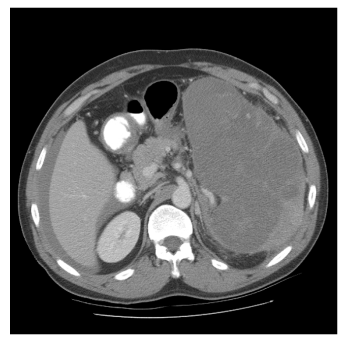
Figure 2 Pre operative pic 2 showing splenic lymphoma.

There are three main pathogenetic factors that may explain the rupture [2]. First, and most important, the congestion of the splenic parenchyma by blast cells; second, coagulation disorders leading to intrasplenic and subcapsular hemorrage, and third, splenic infarction.