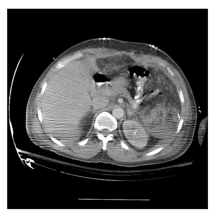
Figure 5 Post operative pic 2 showing splenic I bed following resection.

seem to increase the risk of splenic rupture. A review by Bauer et al. [18] found no significant correlation between survival and platelet number, leukocyte count, or size of the spleen.