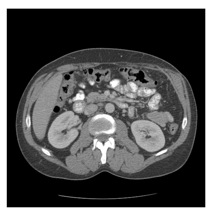
Figure 6 Post operative pic 3 showing splenic bed following resection.

seem to increase the risk of splenic rupture. A review by Bauer et al. [18] found no significant correlation between survival and platelet number, leukocyte count, or size of the spleen.