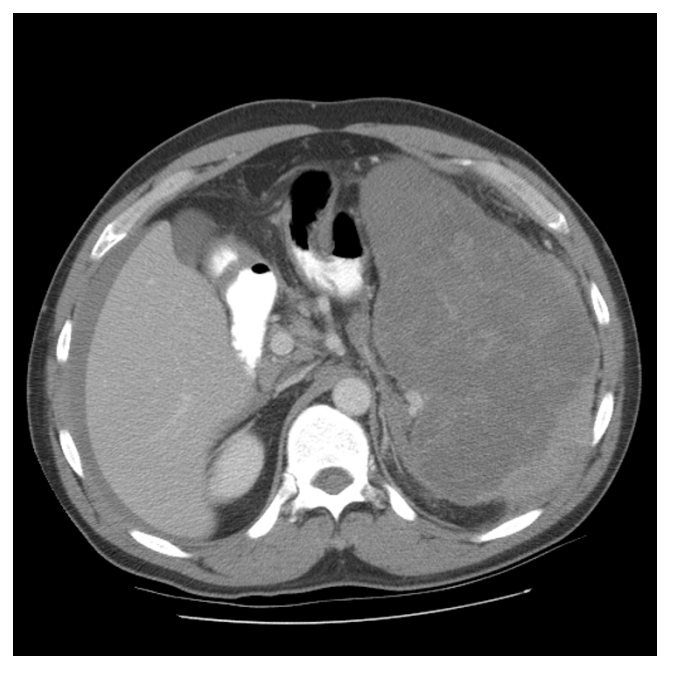
Figure 3 Pre operative pic 3 showing splenic lymphoma.

Coagulation disturbance or thrombocytopenia may play major roles in the pathogenesis of splenic rupture. However, correlations between splenic rupture and coagulation disturbances have not yet been confirmed conclusively. In addition, thrombocytopenia does not