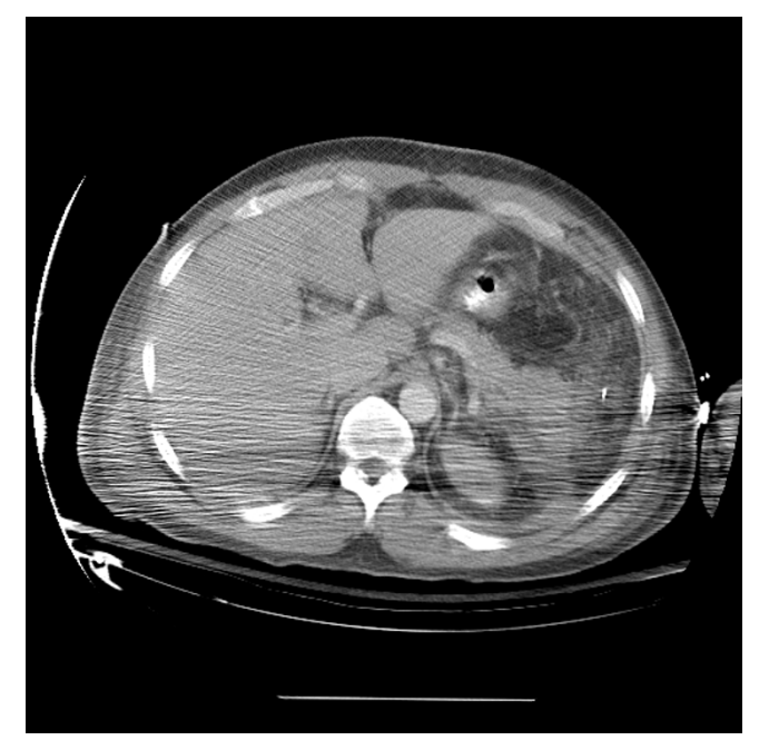
Figure 4 Post operative pic 1 showing splenic bed following resection.

Coagulation disturbance or thrombocytopenia may play major roles in the pathogenesis of splenic rupture. However, correlations between splenic rupture and coagulation disturbances have not yet been confirmed conclusively. In addition, thrombocytopenia does not